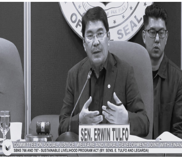
COMMITTEE ON SOCIAL JUSTICE, WELFARE AND RURAL DEVELOPMENT JOINT WITH FINANCIAL SERVICES AND BANKING (SEN. E. TULFO AND LEGARDA)